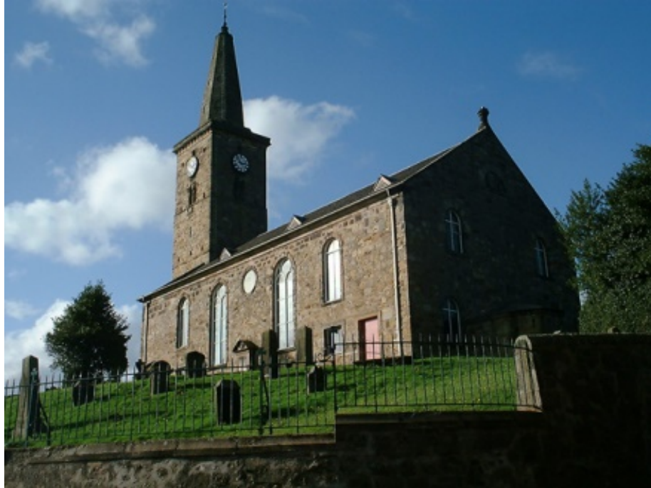
Fig.2. Markinch Parish Church, Markinch, Fife