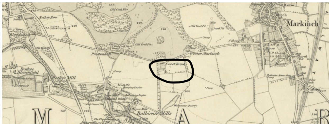
Fig.6. Ordnance Survey Map, 1856 showing Sweetbank, Markinch Parish, Fife