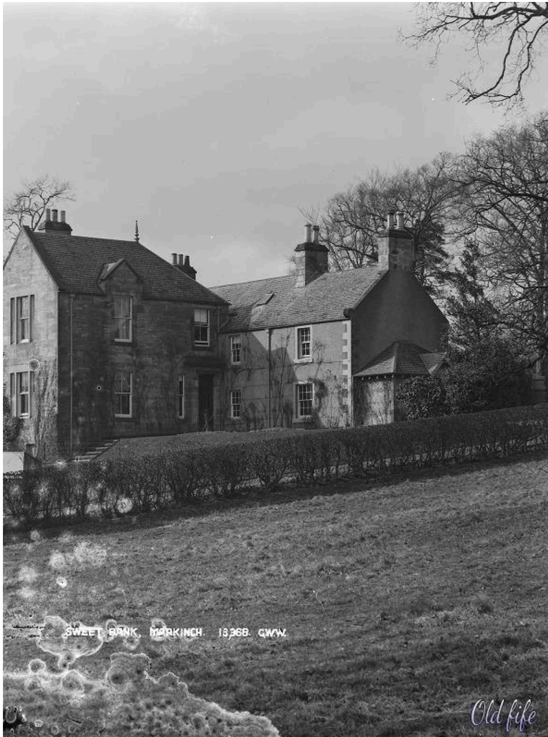
Fig.4. Sweetbank House, Markinch Parish

Now at Sweetbank, the home the family settled in at, it would later become his primary residence for the rest of his life.