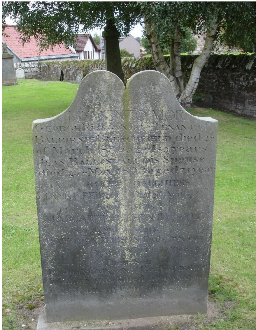
Fig. 7. Pierson Family Gravesite, Kettle Parish Churchyard, Kettle, Fife