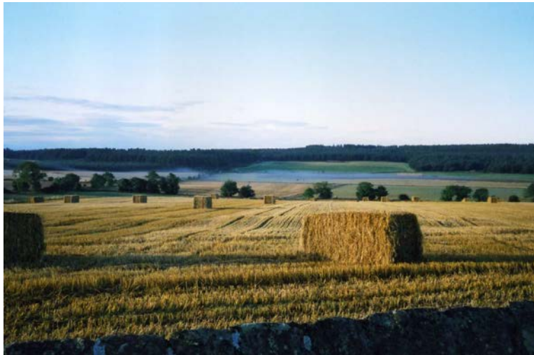
Fig. 5. Farm Fields of Rameldry, Kettle Parish, Fife