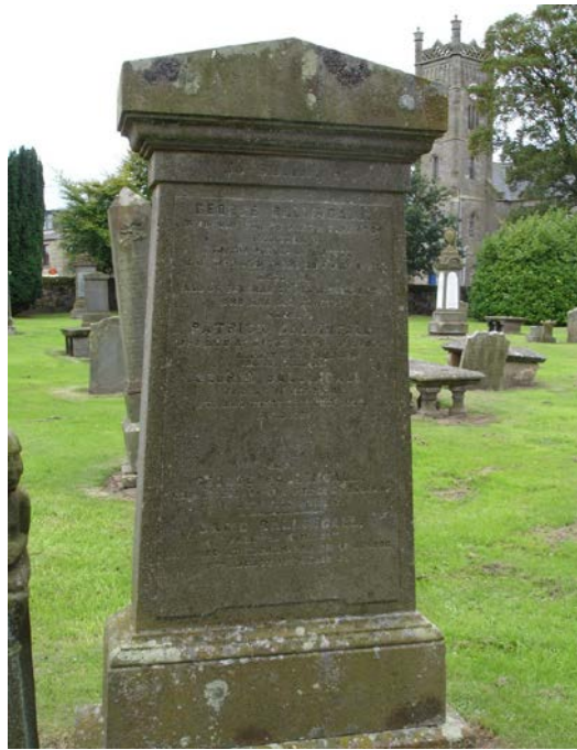
Fig. 6. Ballingall Family Gravesite, Kettle Parish Churchyard, Kettle, Fife