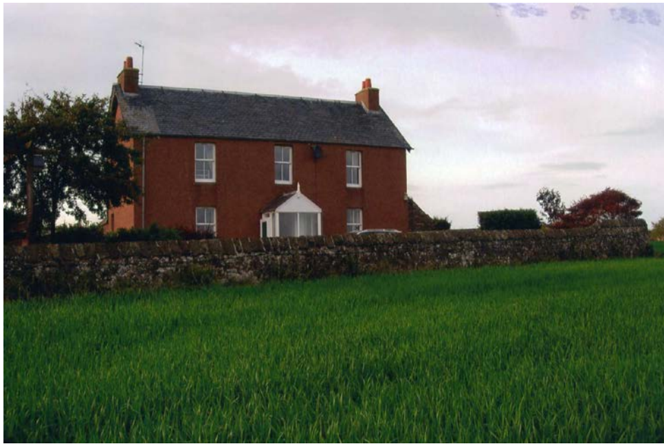
Fig. 2. Rameldry, Kettle Parish, Fife