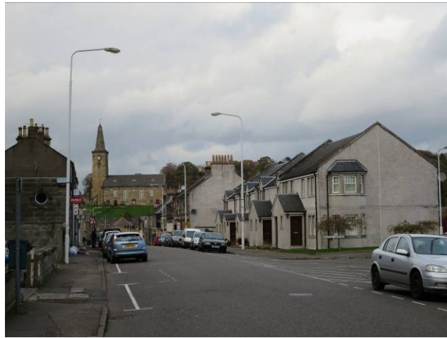
Fig.7. High Street, Markinch, Fife