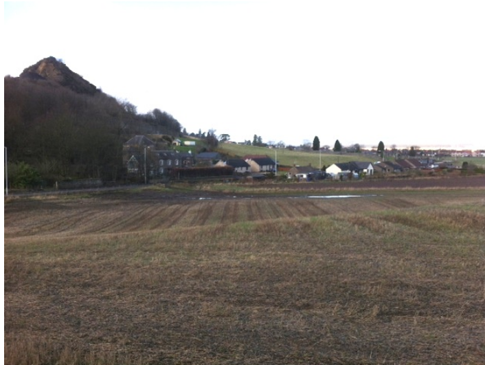
Fig. 5. Craigmill from a distance, Abdie, Fife, Photograph Courtesy of Mrs. Frances Black, Fife Family History Society, 2014